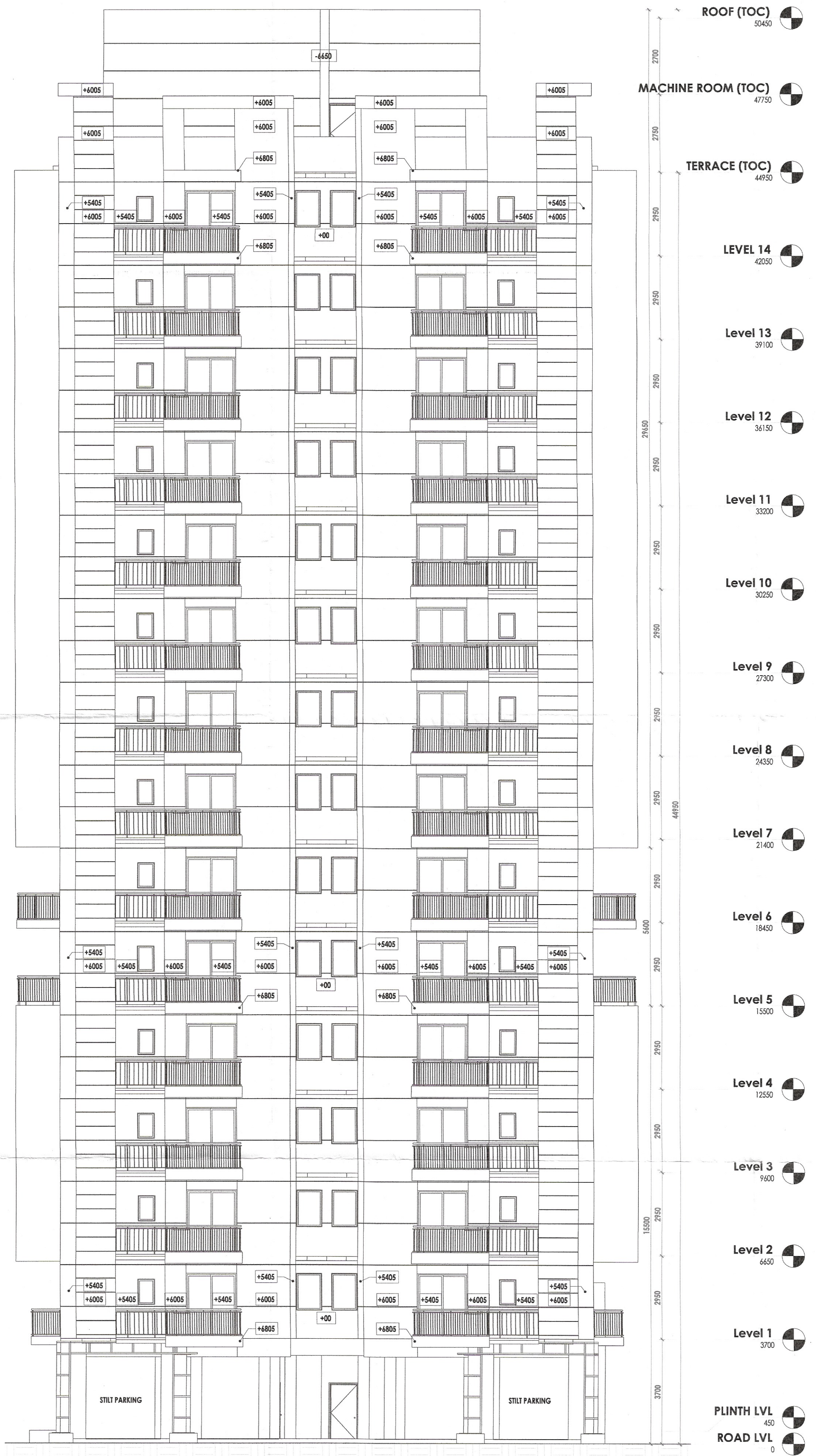
ELEVATION - A