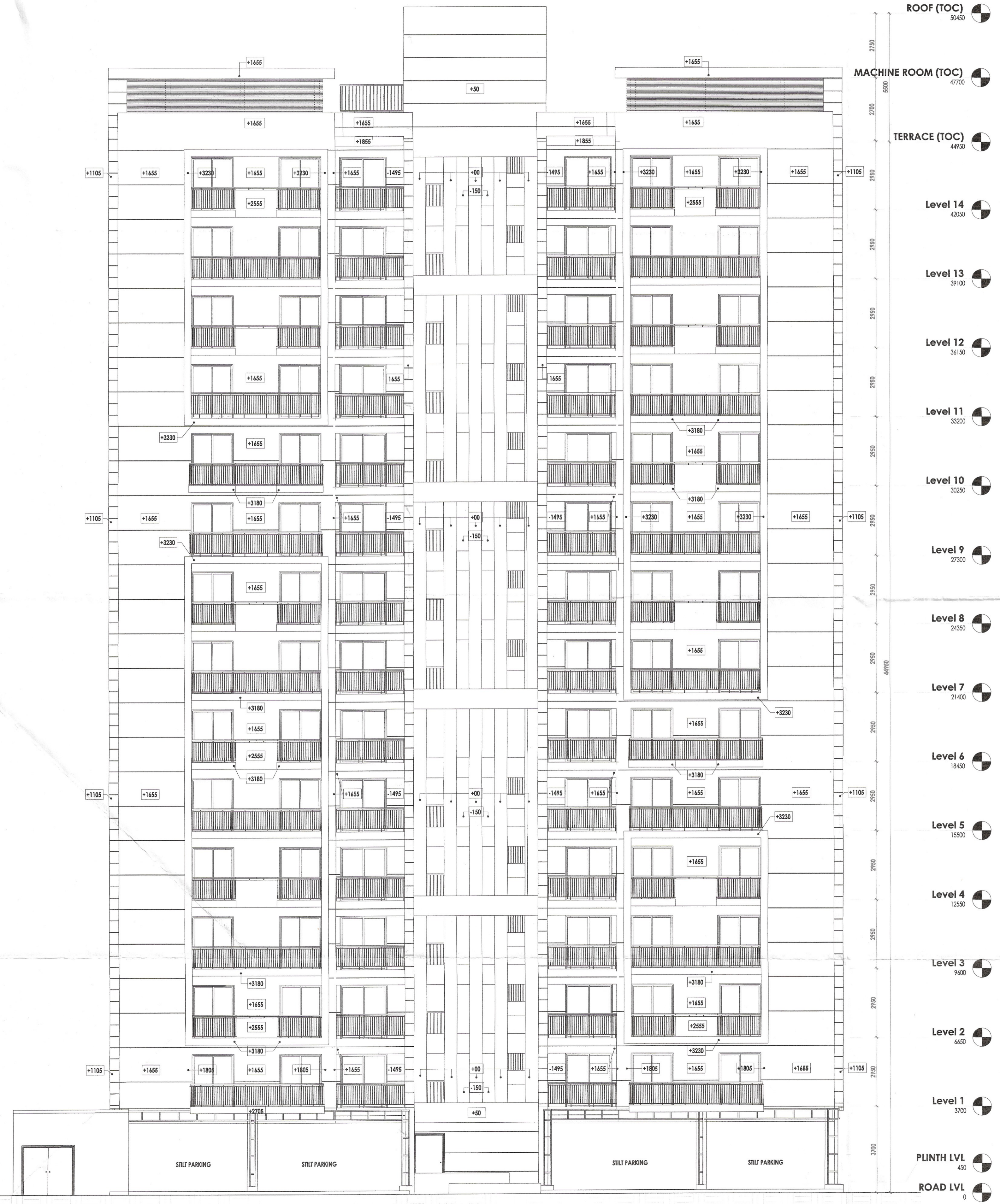
ELEVATION - C