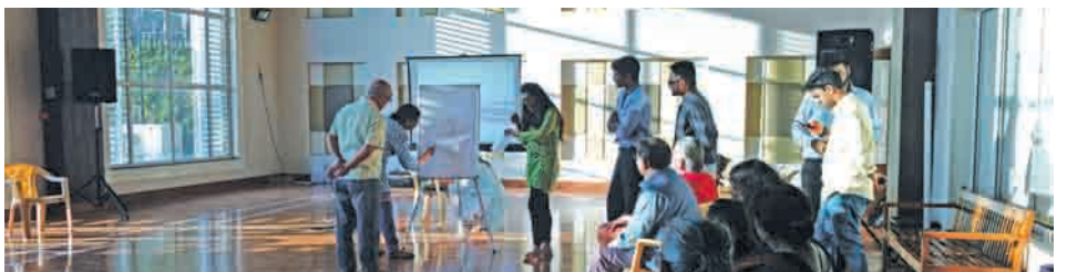
Students from Christ University performed for residents at Lavasa