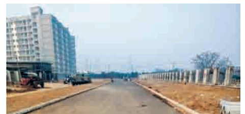
Black topping for road at Ashiana Town, Bhiwadi