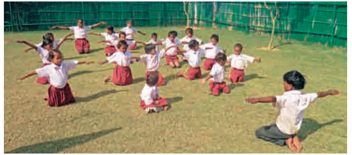
Clean up drive by Phoolwari kids at Ashiana Utsav Lavasa; Phoolwari children do their daily exercise routines at Ashiana Town, Bhiwadi