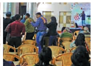
Residents enjoying musical evenings at Utsav Bhiwadi, Utsav Jaipur and Utsav Lavasa