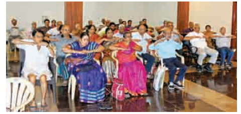
Fun outdoor activities in the sun at Ashiana Nirmay, Bhiwadi; right: guests practice emergency techniques at Ashiana Shubham, Chennai