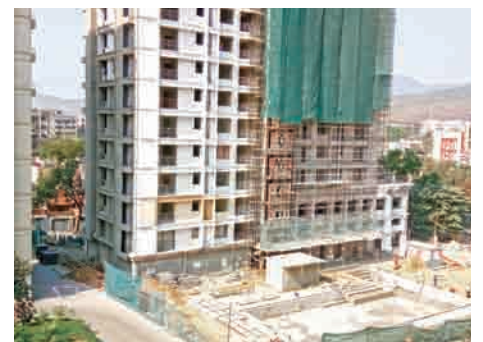
At Ashiana Anantara, Jamshedpur the construction work of Aries and the swimming pool is in full swing

Ashiana Gardens, Jamshedpur is a 30 year old project when some buildings were not eligible for lifts. A lift has now been installed in two blocks of Magnolia building while the rest of the building will be fitted as soon as approval is received.