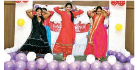
The children's gang onstage with the anchor for a dance performance at Gulmohar Gardens, Jaipur; Dance competition during Christmas celebrations at Ashiana Navrang, Halol