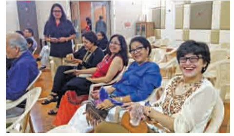
The New Year was celebrated by residents at Utsav Jaipur and Utsav Lavasa with songs, good cheer and good wishes all round