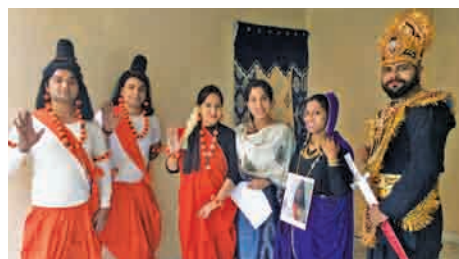
The winners of the mythology skit pose for the camera in costume