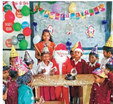
Phoolwari kids celebrating Christmas at Ashiana Town, Bhiwadi; Cutting the cake on Christmas at Ashiana Navrang, Halol