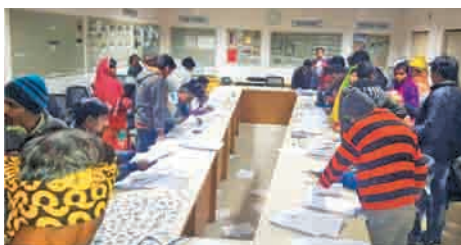
Bank accounts for all labour were facilitated at Ashiana Town, Bhiwadi