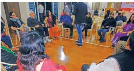
New Year celebrations at Utsav, Lavasa