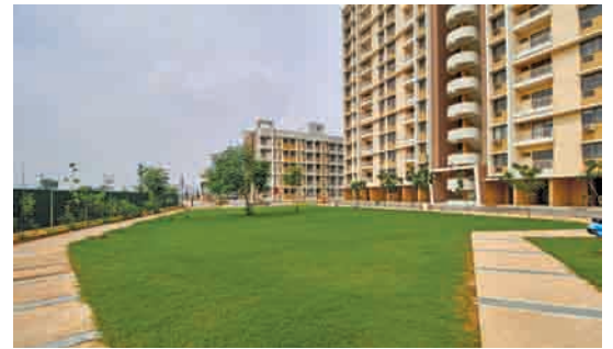
From left: Park development work has been completed in Phase II of Ashiana Town; EWS and LIG flats are ready for handing over; Handovers are in progress at Surbhi Phase 1, Bhiwadi