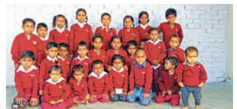
From above: Phoolwari children enjoying a movie show and all dressed up and looking smart in their new winter uniforms at Ashiana Navrang, Halol