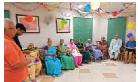
Christmas and an Art of Living session for residents at Bhiwadi; celebrating World Elder's Day at Utsav Care Homes, Jaipur