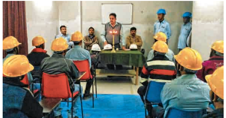
Left to right: Electrical batch started at Ashiana Anantara, Jamshedpur; Tiles Grouting batch started at Vrinda Gardens, Jaipur