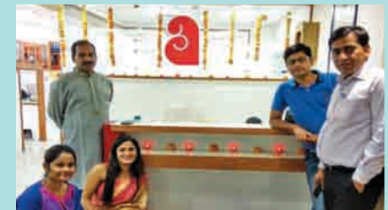
Festival celebrations were held across Ashiana locations

partnership under the provisions of the Limited Liability Partnership Act, 2008. The change is effective from December 22, 2016. Please note that there is no change, whatsoever, except in the legal status/form of the company. The nature of operations, relationships and people remain the same as before.