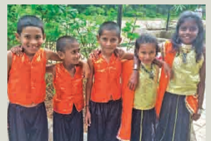
Phoolwari kids put up a dance performance at our Annual Senior Living Sports and Cultural Festival Jashn 3 at Ashiana Utsav, Lavasa.