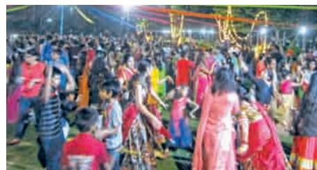
Residents of Ashiana Dwarka, Jodhpur and Rangoli Gardens enjoy the Dandiya dance

Ashiana Amarbagh, Jodhpur, Ashiana Greenwood, Jaipur, Ashiana Dwarka, Jodhpur and at Rangoli Gardens, Jaipur with Garba and Dandiya, which the residents enjoyed thoroughly. The festivities started with a puja of Ma Durga with residents and maintenance staff attending.