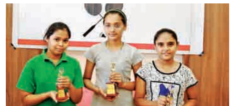
Winners of the Inter-School Badminton competition at Ashiana Navrang, Halol

Ashiana Navrang, Halol organised an Inter-School Badminton competition for schools from Halol and Kalol.