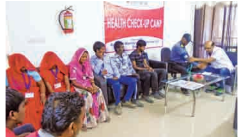
Health Checkup camp at Ashiana Dwarka, Jodhpur