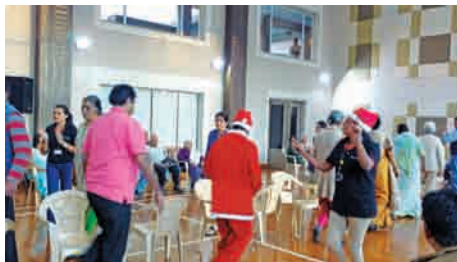
Christmas at Utsav, Lavasa and Utsav Bhiwadi saw residents enjoying garma garam pakodas in the chilly but bracing weather outdoors

More than 120 Utsavites from Jaipur attended Ravan Dahan during Dussehra.