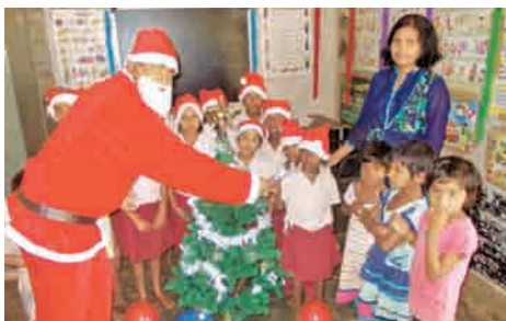
Gifts and sweets for Phoolwari children at Ashiana Utsav, Lavasa