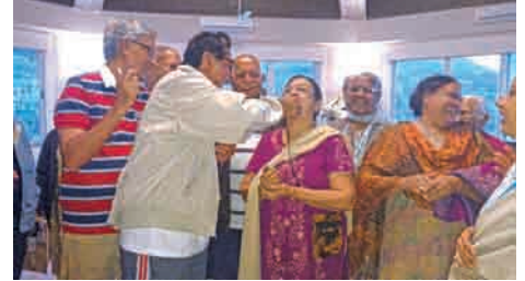
Well attended gatherings of Utsavites at Jaipur, Bhiwadi and Lavasa for the Monthly Get Together parties