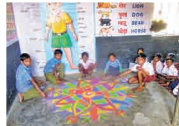
Left to right: Diwali celebrations at Ashiana Tarang, Bhiwadi; Card making and diya lighting activities at Vrinda Gardens, Jaipur; Dussehra celebrations at Ashiana Umang, Jaipur; Rangoli decorations by Phoolwari kids, Jaipur