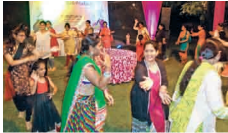
Ladies of Ashiana Amarbagh, Jodhpur and Rangoli Gardens, Jaipur at Karva Chauth puja