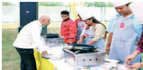
The Ashiana Anmol Super Chef get together had competitors making Khandvi Ravioli

Customers of Ashiana Town, Ashiana Surbhi and Ashiana Tarang, Bhiwadi turned up for the Dandiya Night organised for them at Ashiana Town's central park in Phase 1. Customers along with families