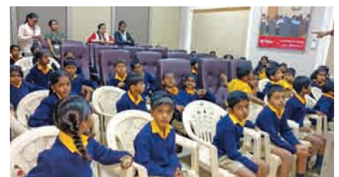
Art classes at Lavasa; and children from Chrystal House enjoy a movie