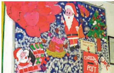
Christmas decorations at Phoolwari, Ashiana Town, Bhiwadi