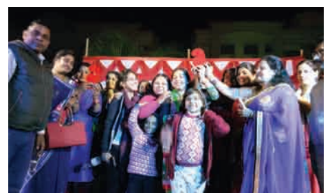
From left: piped gas connections at Ashiana Town, and road and external repairs at Ashiana Aangan, Bhiwadi; and winners of the Inter Ashiana Antakshari competition at Jamshedpur