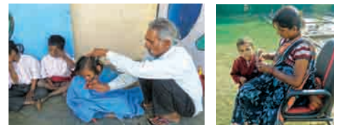
Hair and nails being cut and trimmed for Phoolwari children as part of the Health plus Hygiene activities at Ashiana Town, Bhiwadi

A Clean up Drive and health plus hygiene activities were also organised.