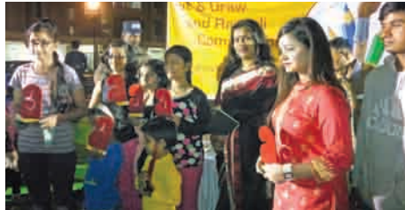
Winners of the Antakshari and Sit & Draw and Rangoli competitions at Jamshedpur

The Inter-Ashiana Antakshari competition was held at Ashiana Brahmananda, Jamshedpur on Christmas combining the celebrations with interactive entertainment. Six teams with