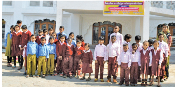
Outdoor visit of Phoolwari kids: they went to a church, gurudwara and Birla temple at Jaipur