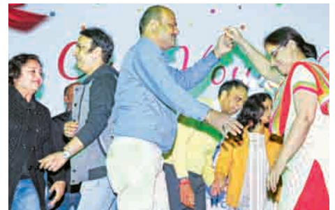
The large gathering at the Club House for its inauguration; Couples dancing on stage at Gulmohar Gardens, Jaipur