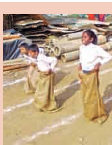
Phoolwari kids celebrating Children's Day at Ashiana Town, Bhiwadi; lemon and spoon race at Ashiana Town, Bhiwadi; Sack race at Ashiana Utsav, Lavasa