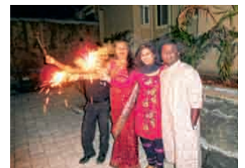
From left to right: Karva Chauth was celebrated by the ladies of Utsav, Jaipur; Utsav, Bhiwadi residents enjoying mehendi on Karwa Chauth; Diwali celebrations at Ashiana Utsav, Jaipur and Ashiana Utsav, Lavasa