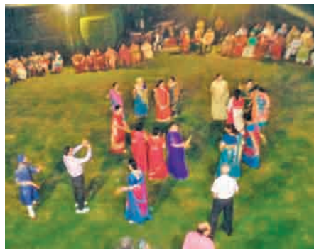
Utsav residents enjoying Garba Night and attending the Ayurveda camp at Bhiwadi