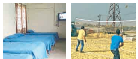
Upgradations at Ashiana Anmol staff room and sports facilities

Supervisor's homes at Ashiana Anmol, Gurgaon have been upgraded to provide a better lifestyle. A badminton court has also been included on the premises for staff to include sports in their daily lives.