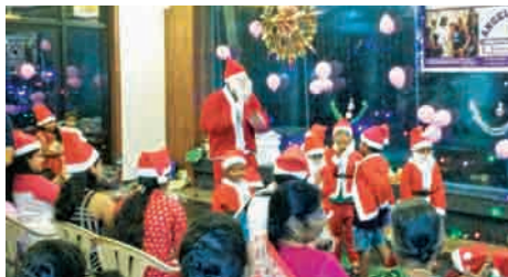
Christmas at Ashiana Shubham, Chennai

A musical evening at Ashiana Nirmay, Bhiwadi in its new green area was planned as a Jashn flashback with customers enjoying the retro songs. They