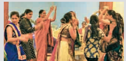
Dandiya Nights: Ashiana Shubham, Chennai organised a special Dandiya Night followed by snacks.