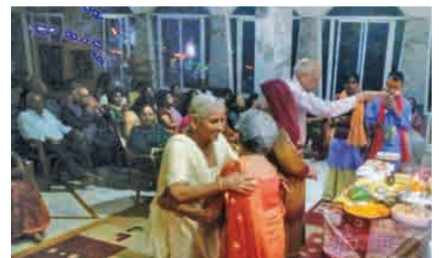
Residents exchange greeting in the mandir during Diwali celebrations

started with Lakshmi puja followed by burning of crackers and a session of tambola. Residents lit diyas and shared sweets as well as crackers and candles. The festivities were followed by snacks and dinner.