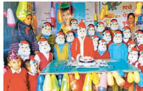
Cutting the cake on Christmas at Gulmohar Gardens, Jaipur