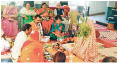
Residents perform Tulsi Vivah at the temple