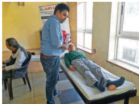
Physiotherapy Camp at Utsav, Jaipur