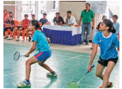
Dussehra was celebrated across Bhiwadi and Neemrana; winners at the Inter-Ashiana meets; participants in the Badminton event