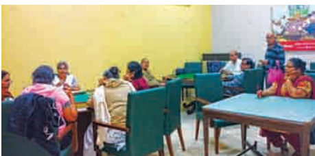
Utsavites gather for their favourite Tambola at Jaipur, Bhiwadi and Lavasa