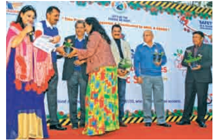
Santa Claus cuts the cake with residents Ashiana Amarbagh, Jodhpur; Christmas celebrations at Rangoli Gardens, Jaipur were enjoyed by a large gathering; guests were gifted plants for Christmas and for participation in the Traffic Awareness event

rectification work without residents having to remind them or specially follow-up again with anyone.