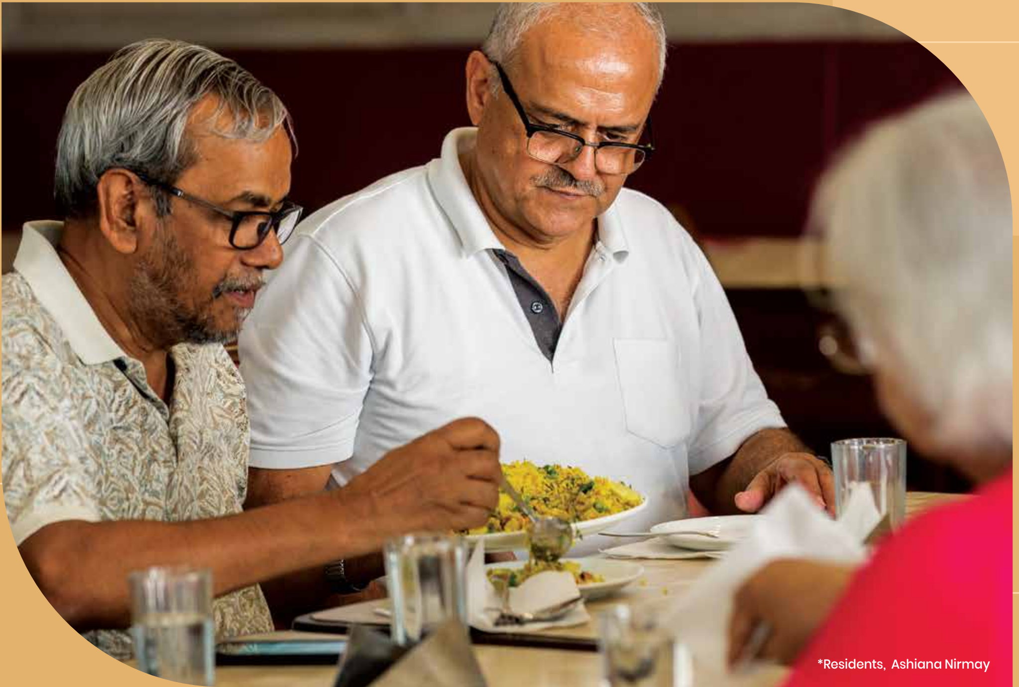
*Residents, Ashiana Nirmay