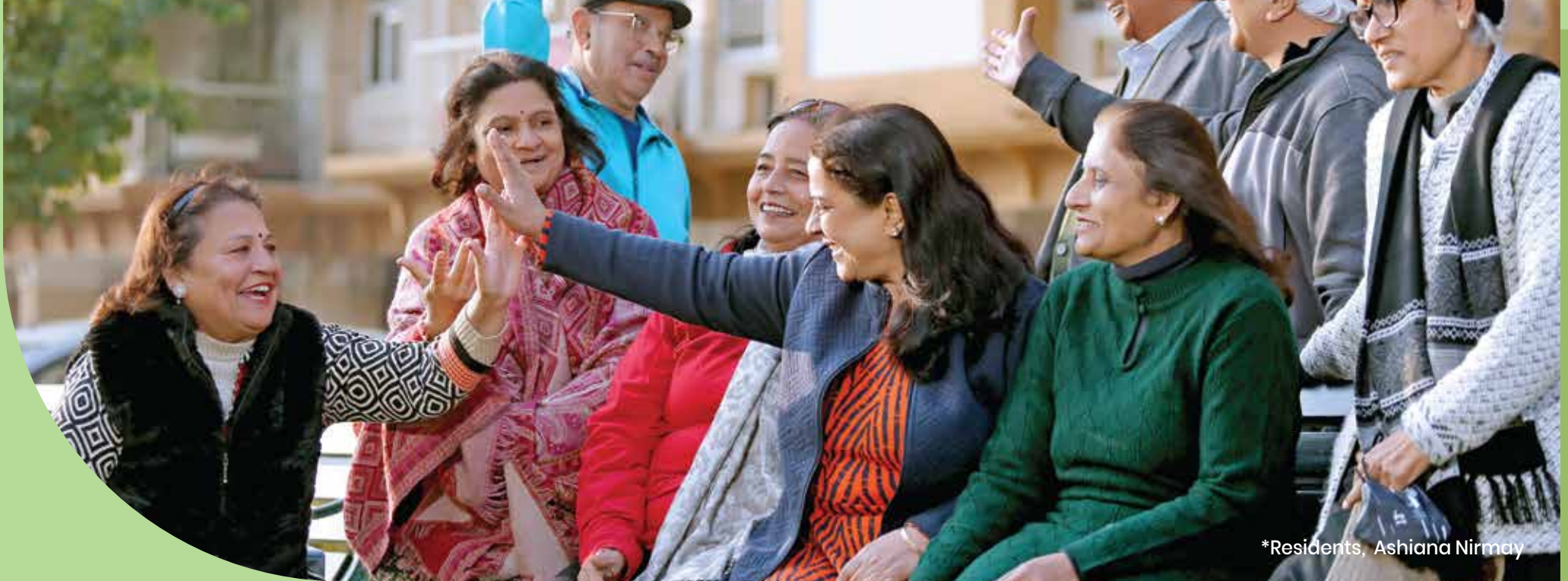
*Residents, Ashiana Nirmay