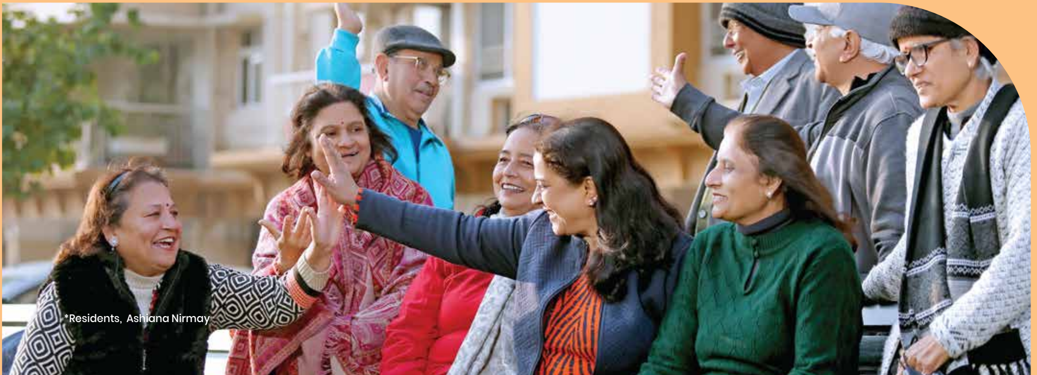
*Residents, Ashiana Nirmay

Your life at Ashiana Nirmay will be planned in such a way that every day will be a new experience! Relive your college days in an environment that promotes companionship and camaraderie amid like-minded people. Not only great company but also tambola evenings, movie shows, seminars, cooking classes and so much more are sure to keep you busy all day long.