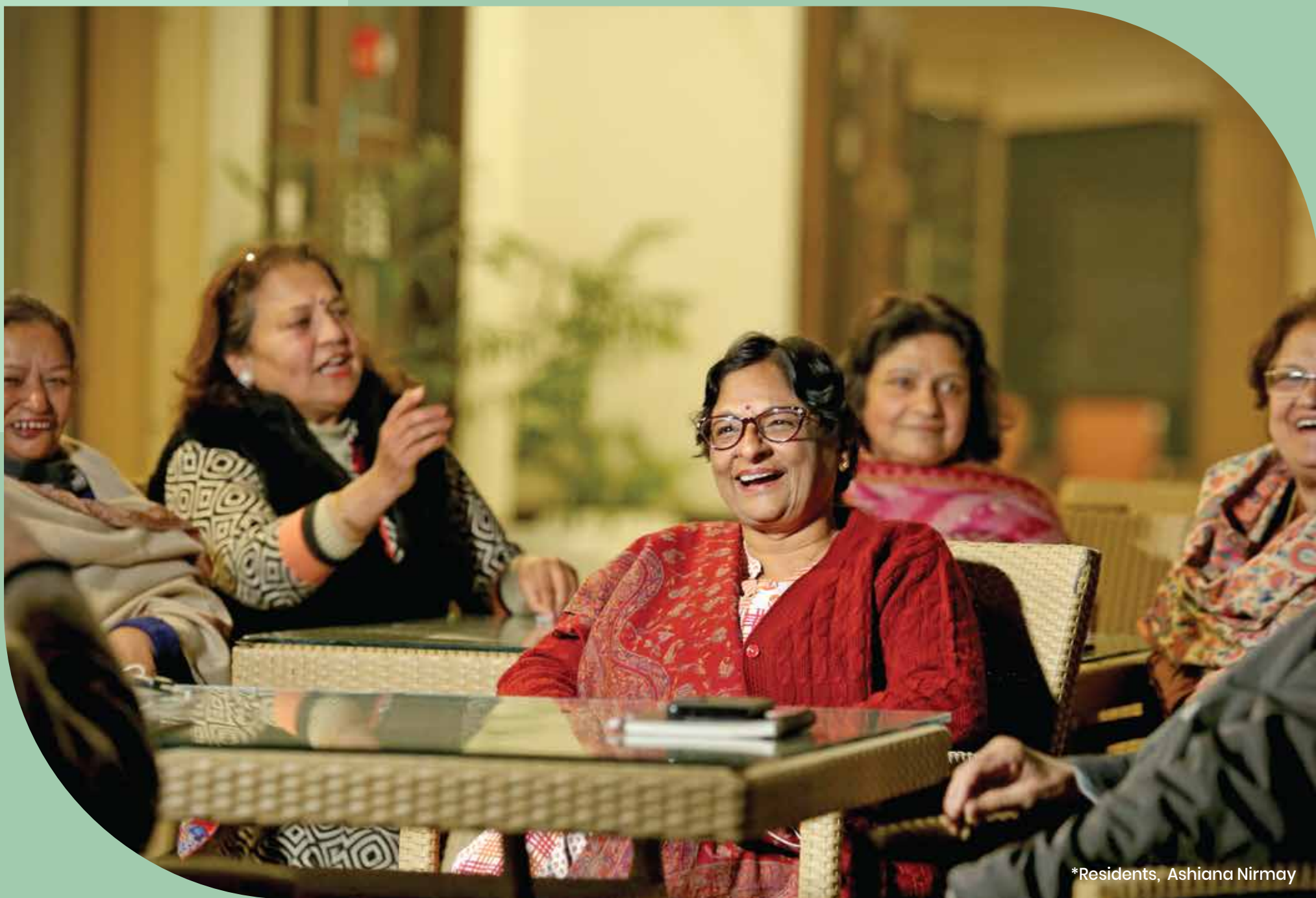
*Residents, Ashiana Nirmay