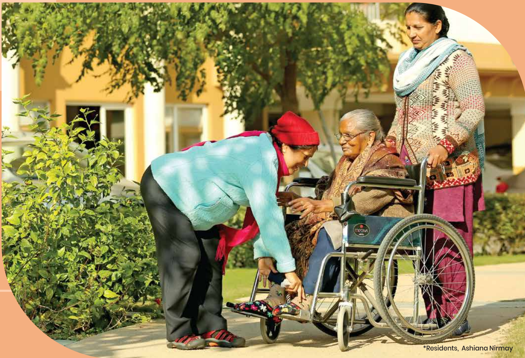
*Residents, Ashiana Nirmay