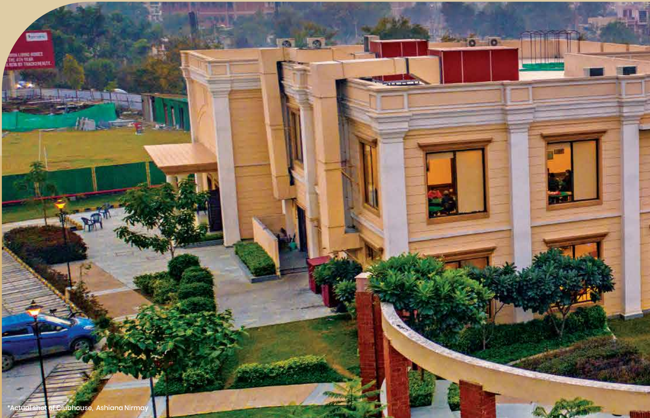
*Actual shot of Clubhouse, Ashiana Nirmay