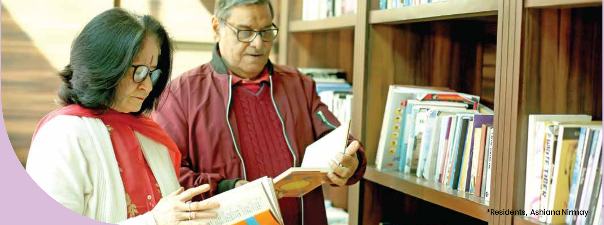
*Residents, Ashiana Nirmay