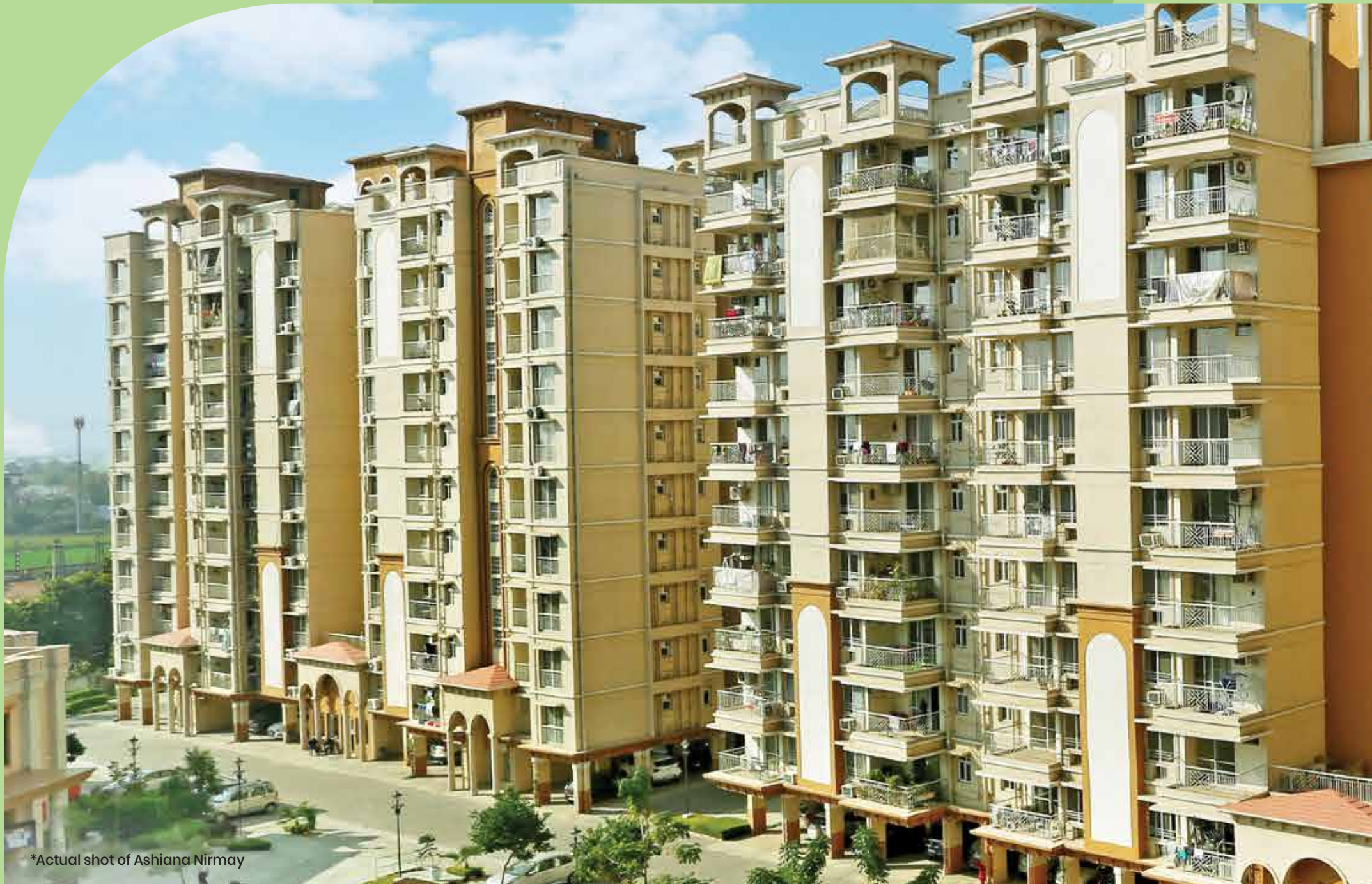
*Actual shot of Ashiana Nirmai