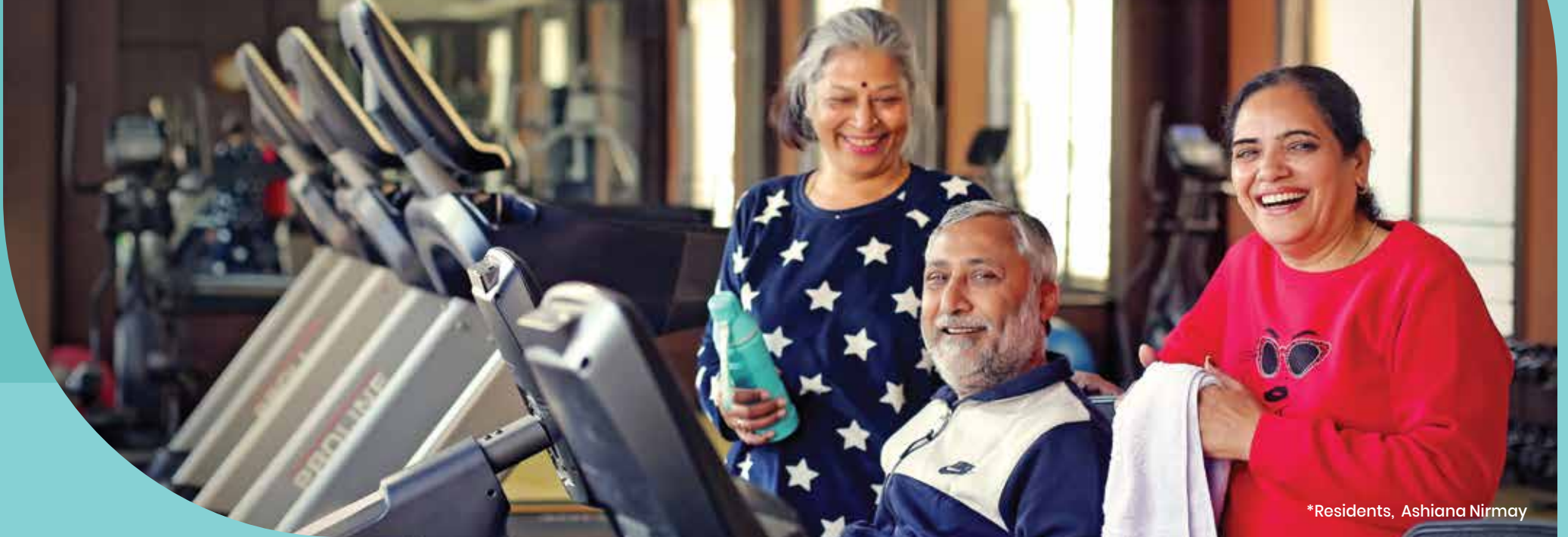
*Residents, Ashiana Nirmay