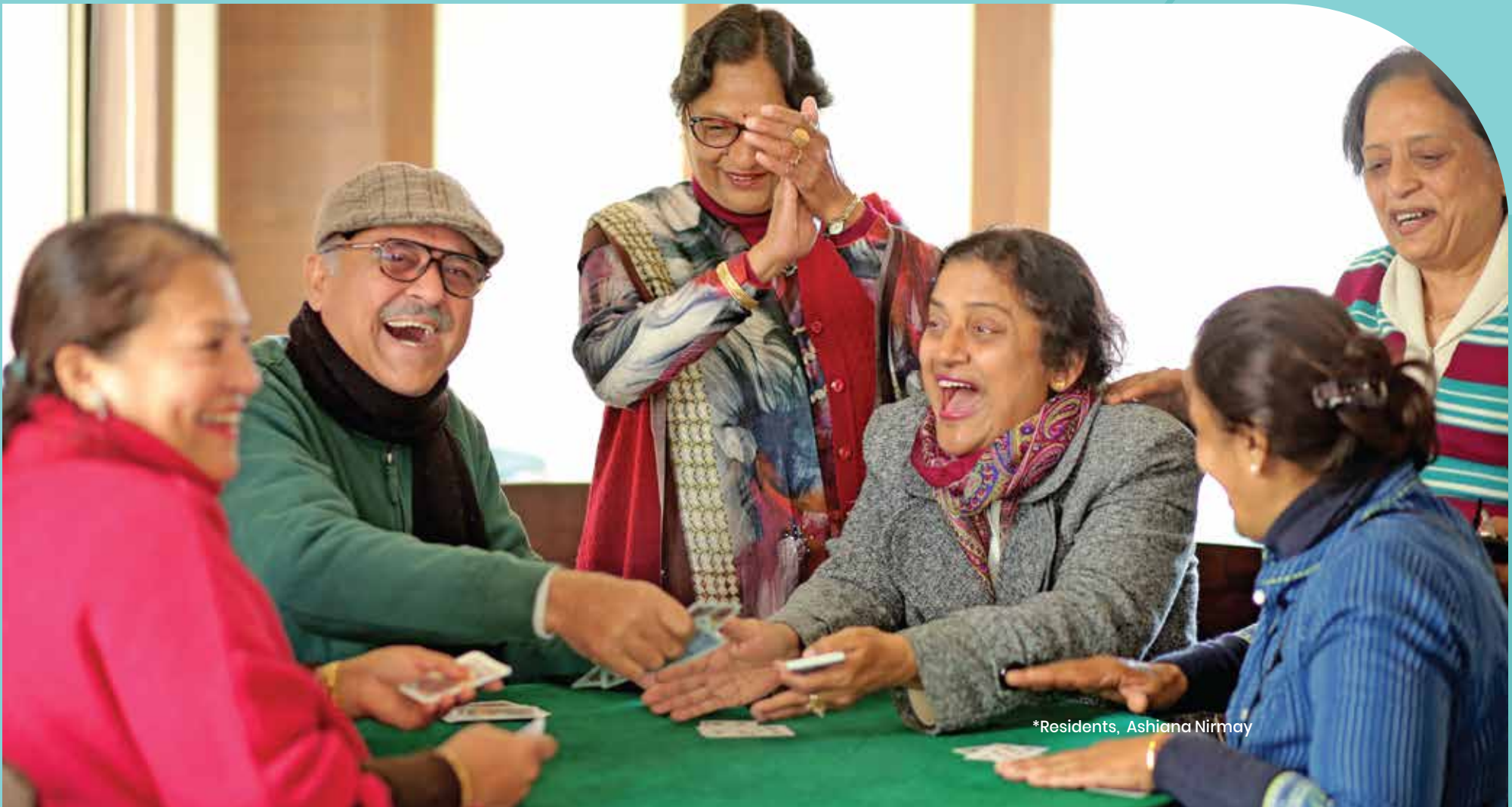
*Residents, Ashiana Nirmay

There is also an OPD and nurse on stand-by whenever needed. And if ever required you will also be able to avail the services of a physiotherapist and caregiver at our Care Homes.