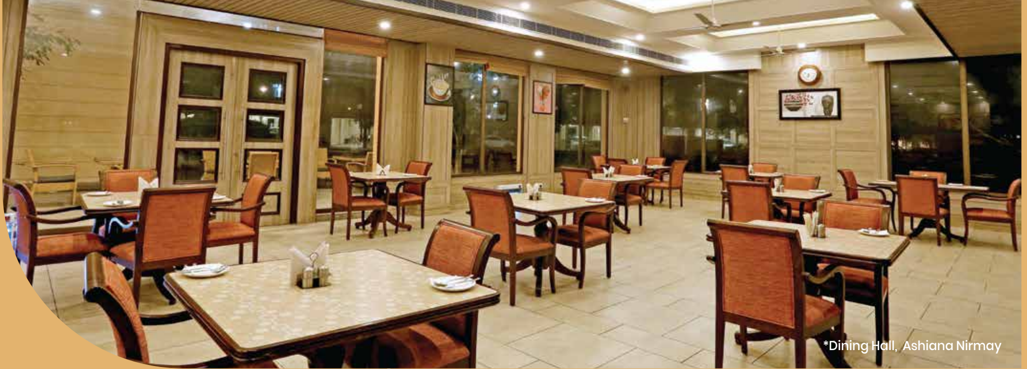
*Dining Hall, Ashiana Nirmay