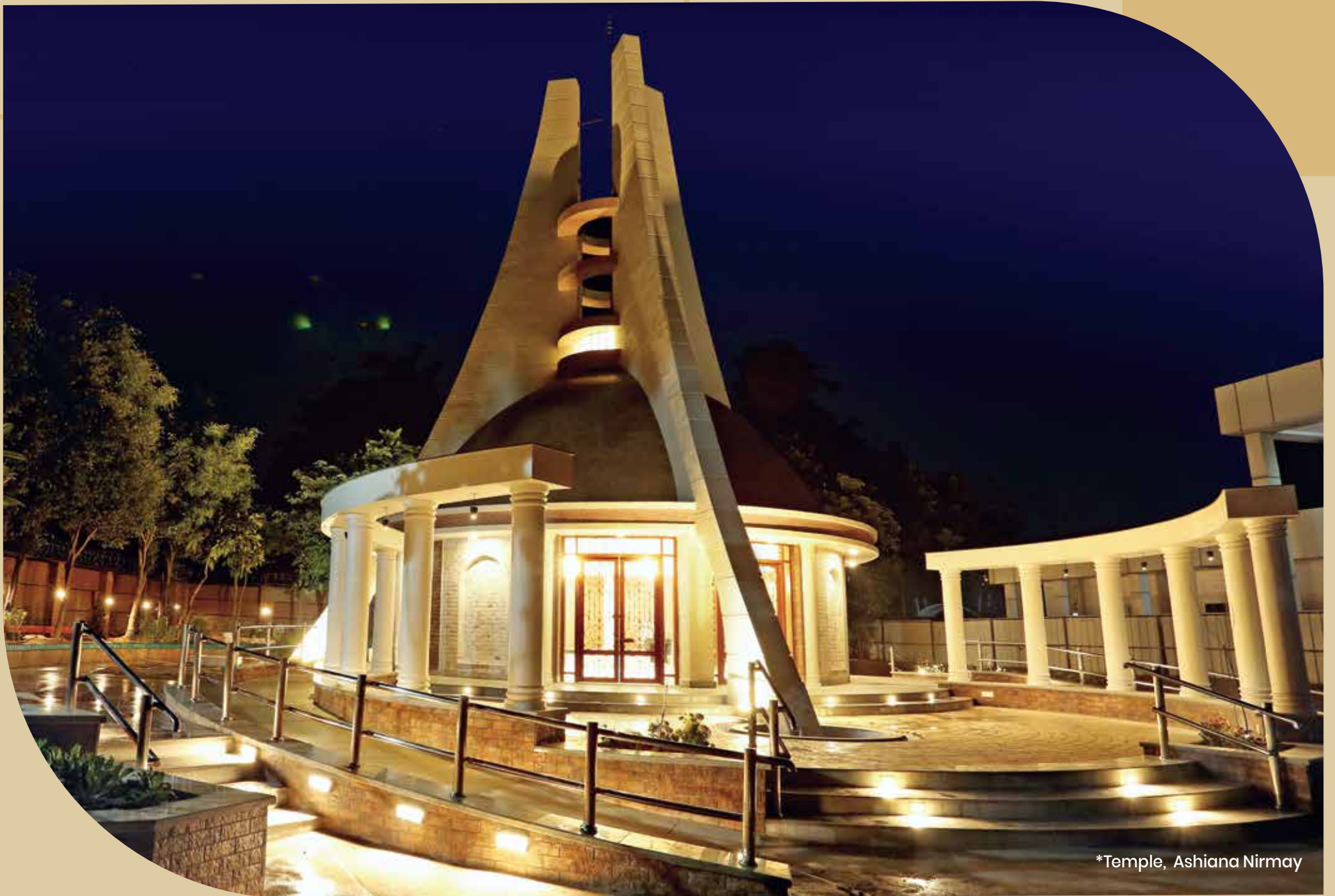
*Temple, Ashiana Nirmai