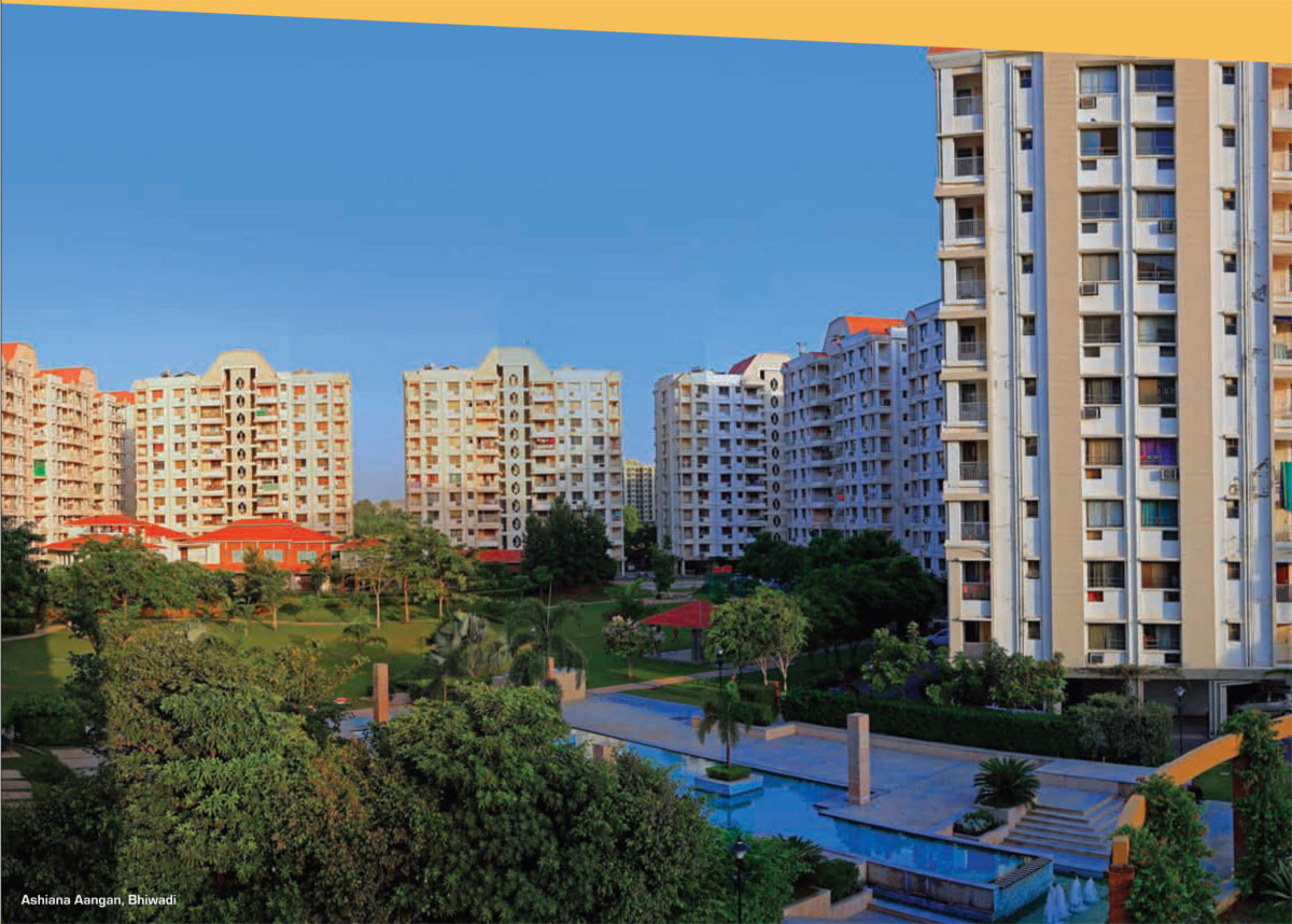
Ashiana Aangan, Bhiwadi