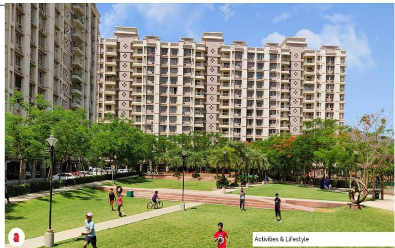
Activities & Lifestyle