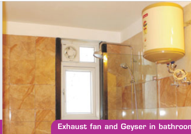
Exhaust fan and Geyser in bathroom