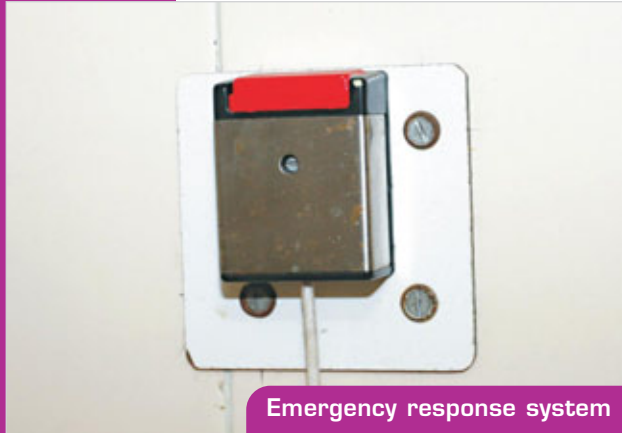
Emergency response system