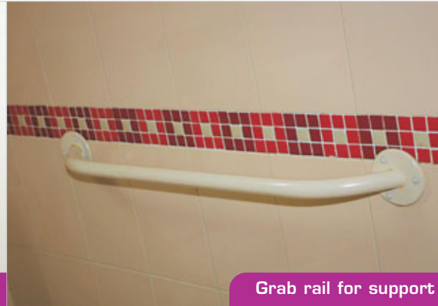
Grab rail for support