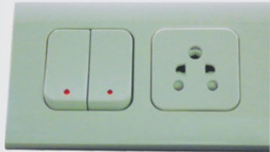
Switches with light indicators