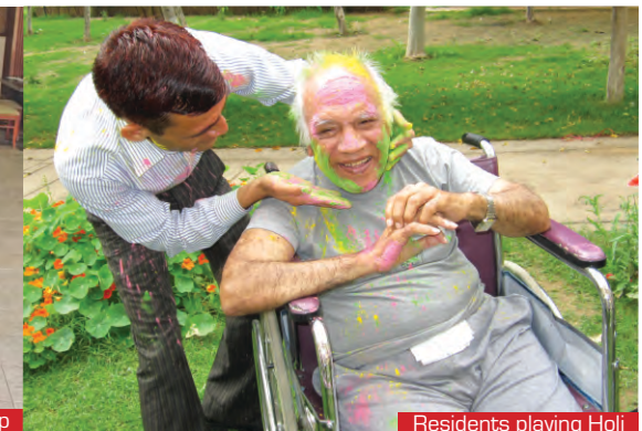
Residents playing Holi