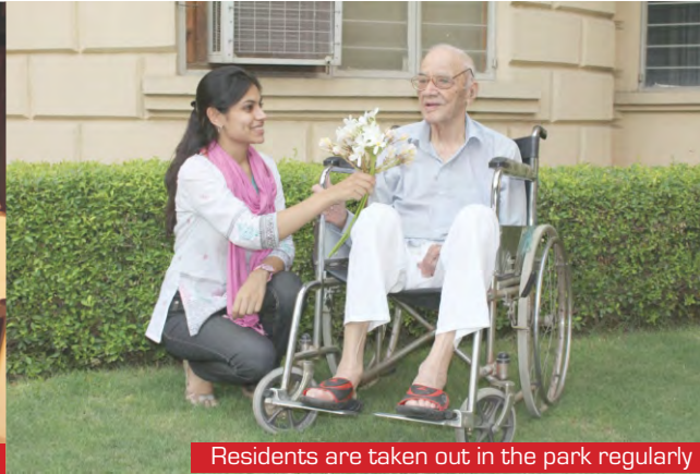
Residents are taken out in the park regularly

"I'm at a place where I'm doing something that I'm proud of. After completing Ashiana's training program, I feel am more capable of taking care of seniors. I feel blessed to be here."