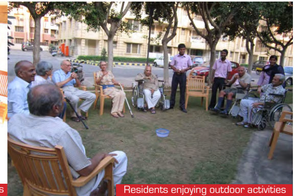
Residents enjoying outdoor activities