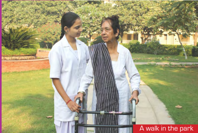
A walk in the park