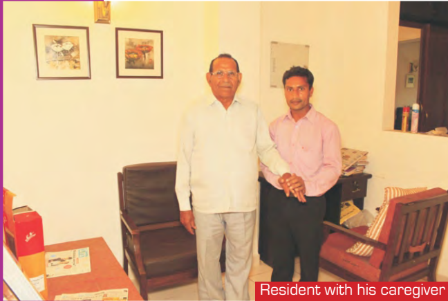
Resident with his caregiver