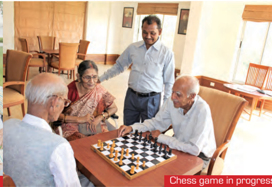
Chess game in progress