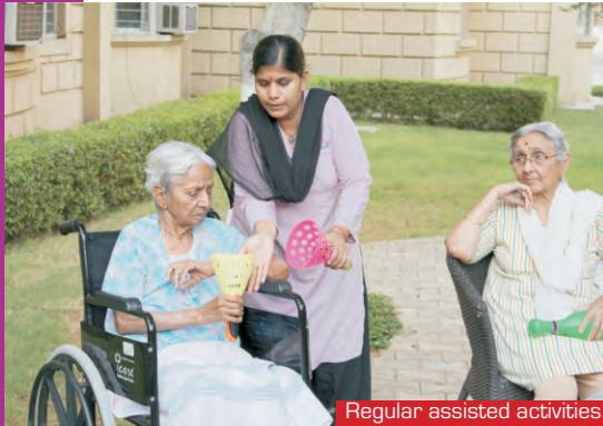
Regular assisted activities