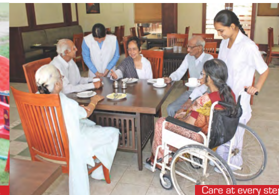
Care at every step