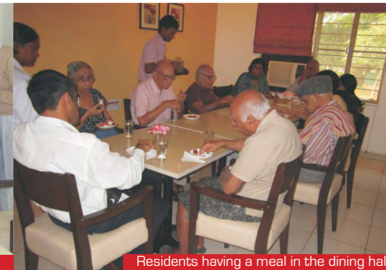
Residents having a meal in the dining hall