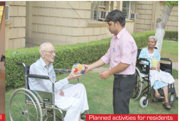
Planned activities for residents