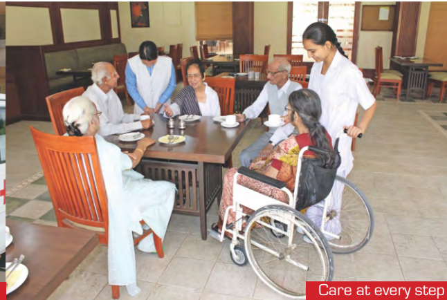
Care at every step