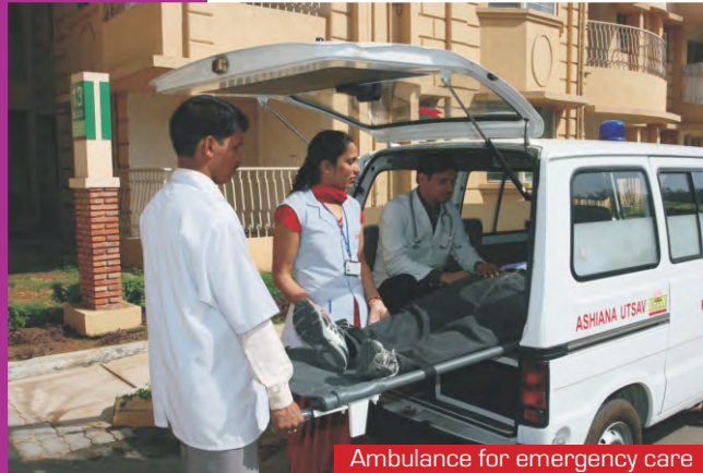
Ambulance for emergency care