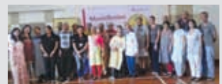
Musical Evening: Musicsmiles, a music group from Pune, played a session at Utsav Lavasa