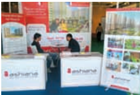
The Ashiana stall at the Dainik Bhaskar Expo at Rajwada Palace, Jagatpura, Jaipur

A group of about 150 medical distributors from Jodhpur visited the Ashiana Dwarka Jodhpur site to view the sample flat. They were full of compliments