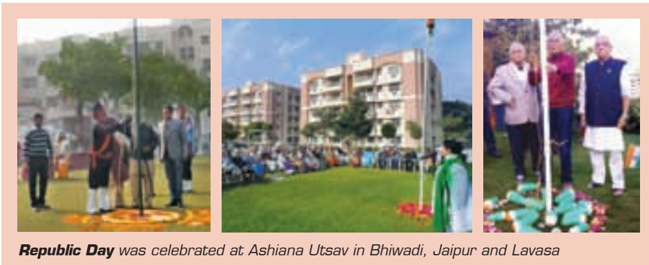
Republic Day was celebrated at Ashiana Utsav in Bhiwadi, Jaipur and Lavasa