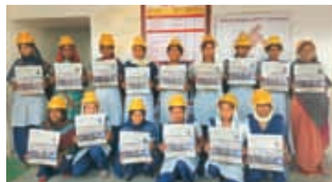
The new Tiles Grouting batch, Ashiana Town Bhiwadi; Advanced Electricals batch at Ashiana Town Bhiwadi; Proud women recipients of certificates from the Tiles Grouting batch at Ashiana Umang, Jaipur