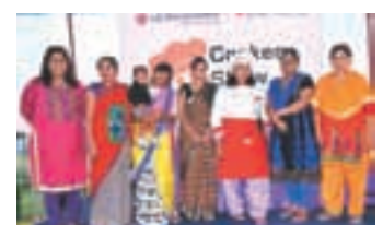
Left to right : AGM of the Halol Plastic Association, the Lion's Club of Halol and at the demonstration of oven recipes at Halol