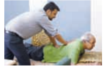
Photography exhibition for residents; wellness programmes at Ashiana Utsav, in Bhiwadi, Jaipur and Lavasa

Just Fit Centre. Utsavites participated actively and learnt how to maintain physical fitness.