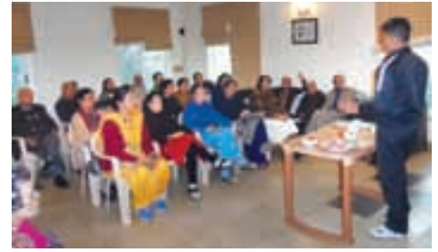
Anniversary celebrations at the month end party at Ashiana Utsav Bhiwadi; Fitness Session and a Cookery Show at Ashiana Utsav Jaipur