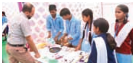
Exhibits at the Bal Mela by children from Government School, Ghatal Village, Bhiwadi

Bal Mela was organised in conjunction with National Science Day at Ghatal