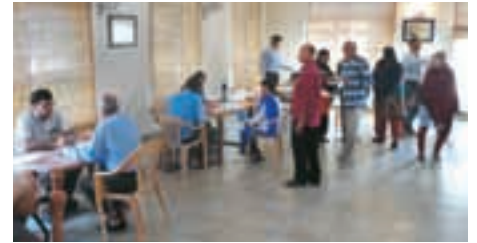
At the orthopaedic awareness camp at Utsav Care Homes, Jaipur. Other activities at Jaipur included a visit by an audiologist to conduct a Hearing Seminar and a Mega Check Up Camp with special emphasis on urology