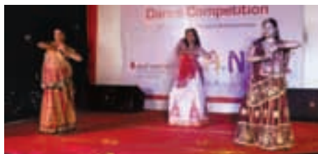
Participants of Ashiana Brahmananda performing a group dance

This was the first Inter-Ashiana event conducted at our newly developed site Ashiana Anantara.