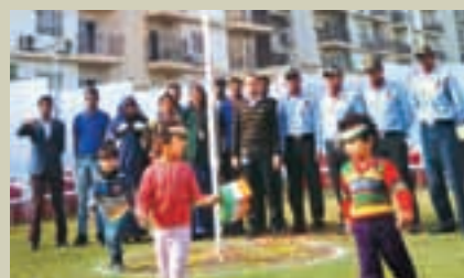
Republic Day being celebrated by Ashiana residents of Bhiwadi and Jaipur with great enthusiasm