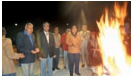
Lohri celebrations at Ashiana Utsav, Jaipur with music and a bonfire

Month end parties were arranged regularly every month at Ashiana Utsav in Bhiwadi, Jaipur and Lavasa . New residents were welcomed and birthdays and anniversaries celebrated. There were games, songs, jokes, poems and lots of