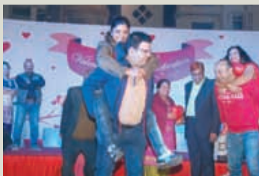
Valentine's Day was another festive occasion for Ashiana clients to celebrate with friends and families at Ashiana Dwarka Jodhpur and at Vrinda Gardens Jaipur