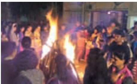
Lohri celebrations at Bhiwadi were centred around a large bonfire

Ashiana Tarang Bhiwadi. All six Ashiana projects in Bhiwadi took part in the event. After some very entertaining and tough matches, Ashiana Village and Ashiana Aangan qualified for the final in which Ashiana Aangan was crowned the Inter Ashiana cricket champions for 2016.