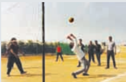
Republic Day celebrations drew residents and staff from all Ashiana projects for flag hoisting ceremonies. At Ashiana Aangan, Neemrana, a volleyball match for staff members rounds off the day