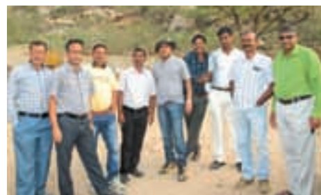
Day trippers from Bhiwadi set out in a group on a trip to Dhosi Hill

programmes, enjoyed the event and have liked the new store.