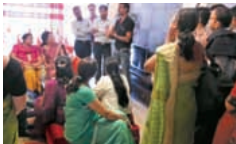
Corporate cricket at Ashiana Tarang Bhiwadi; Teachers visit Ashiana Dwarka Jodhpur