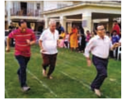
Residents young and old, of Greenwood, Bhiwadi showcase their fitness, love of a healthy lifestyle and athletic abilities on Sports Day