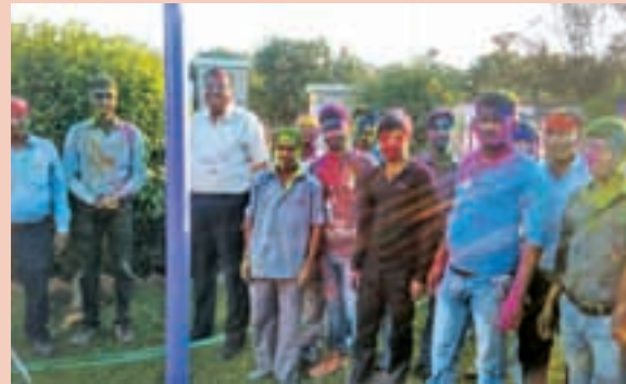
Holi: The festival of colours was celebrated as always at all Ashiana projects with great fun, frolic and of course bright colours