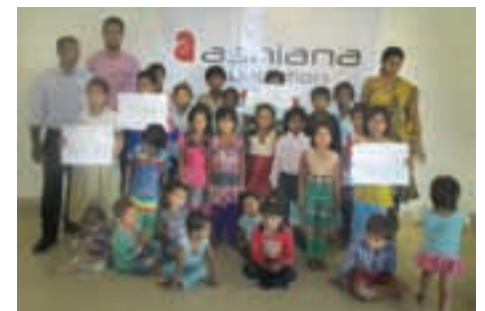
Participants display their efforts at the Sit and Draw competition at Gulmohar Gardens

Sunday night was special for Ashiana Manglam Jaipur with the performance of Kalbelia, a Rajasthani folk dance at Park 1 followed by a magic show for children. People stayed back late for the popular Tambola sessions.