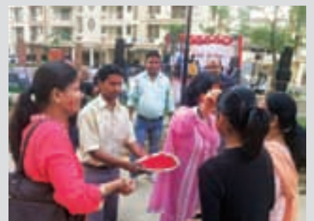
Holi Celebration: The colourful celebrations of Holi were spread across all Ashiana project locations as seen in these scenes of shared joy and festivities from Ashiana locations at Jaipur, Bhiwadi, Jodhpur and Jamshedpur