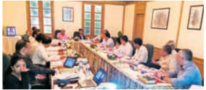
The annual Sales training workshop in Bhiwadi was lively and very interactive; right: Priorities being discussed at the Strategy Meet in Goa