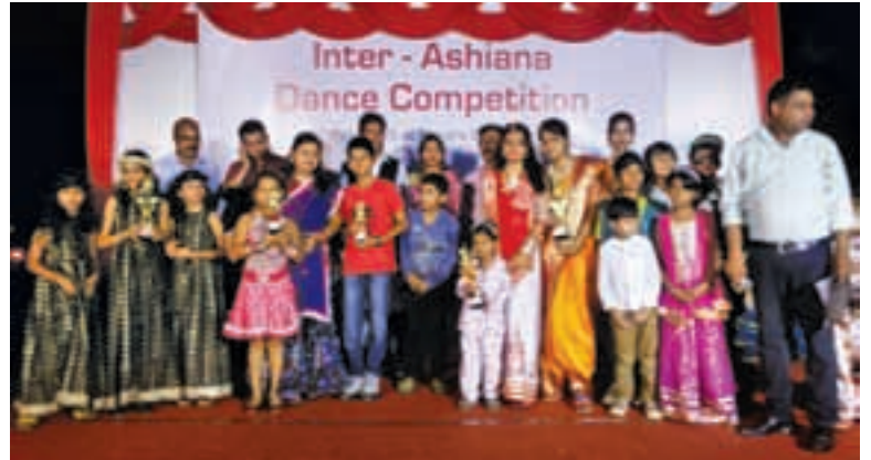
Proud winners pose for group photographs with their trophies after the Inter-Ashiana tournaments in badminton and dance at Jamshedpur