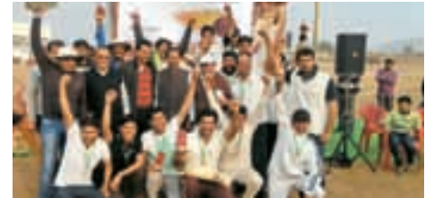
Cheers for the winners at the Inter Ashiana Cricket tournament

An Inter Ashiana Dance competition was held at Ashiana Brahmananda Jamshedpur with participants from Ashiana Anantara, Ashiana Residency Greens, Ashiana Woodlands, Ashiana Gardens . A very large crowd of