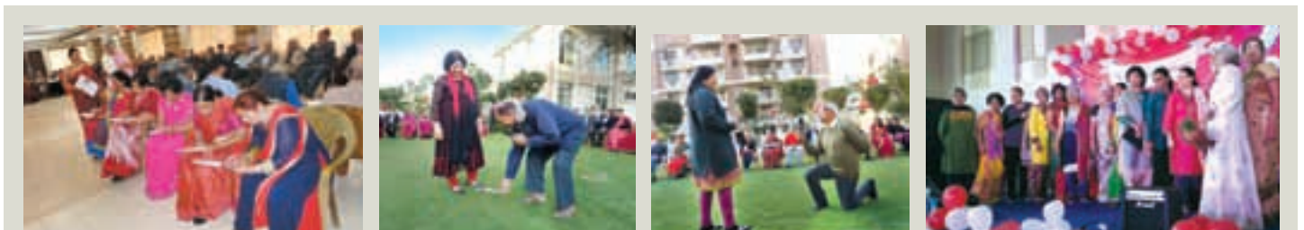
Valentine's Day: Couples celebrated love with romantic songs and a variety of games and quiz contests designed for spouses to share fun and laughter at Ashiana Utsav Bhiwadi, Jaipur and Lavasa