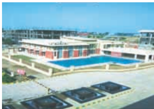
Ashiana Navrang, Halol participated in the Vadodara CREDAI Exhibition in January; right: The Club House at Ashiana Navrang, Halol is in its final stages