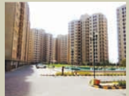
Ashiana Town, Phase-I Bhiwadi

Ashiana Town Bhiwadi is bringing smiles of satisfaction among customers. After quality checks, 411 flats out of 448 have been released for possession. Handovers registered a score of 82% on the "khushimeter".