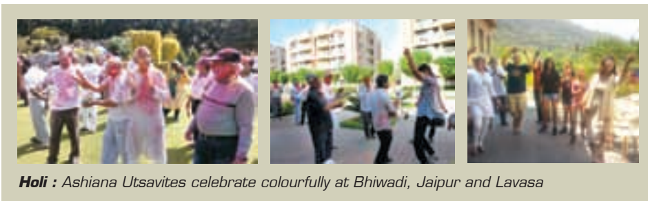
Holi : Ashiana Utsavites celebrate colourfully at Bhiwadi, Jaipur and Lavasa