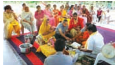
Jaipur Utsavites performing puja during Maha Shivratri

interaction as residents mingled over snacks and dinner.