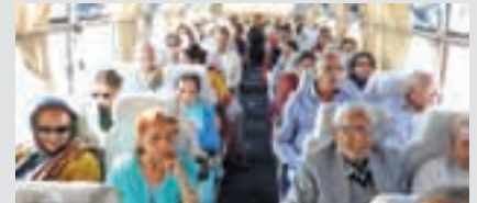
Temple Visit: Jaipur Utsavites like religious trips and paid a visit to Salasar Balaji Temple

An interesting Anand Mela was specially organized for Ashiana Utsav, Jaipur . The Mela focused on street foods like pani-puri, chole tikki and papri chat and were relished by all Utsavites. They had a good interacting with each other while enjoying old songs.