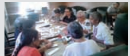
Art Classes: Art classes have been started at Utsav Lavasa and are well attended