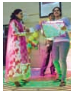
The Song and Dance Competition at Ashiana Amarbagh Jodhpur enthralled the audience with colours, movement, music and entertainment

Ashiana Tarang Bhiwadi. All six Ashiana projects in Bhiwadi took part in the event. After some very entertaining and tough matches, Ashiana Village and Ashiana Aangan qualified for the final in which Ashiana Aangan was crowned the Inter Ashiana cricket champions for 2016.