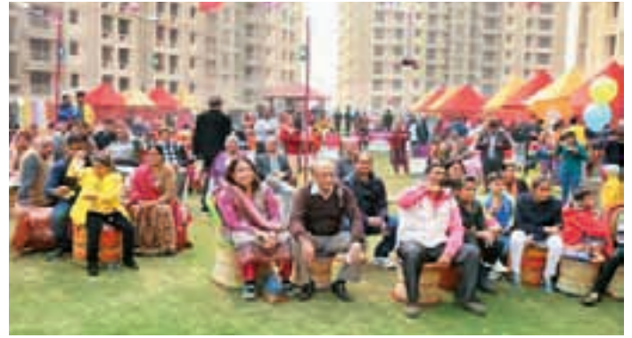
Punjabi bhangra was really enjoyed by everyone in the large gathering at Ashiana Town, Bhiwadi for the Punjab da Pind event