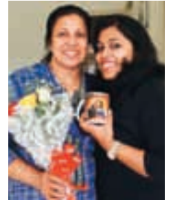
Happiest Handovers: Staffers are the happiest home owners in various Ashiana projects as they receive possession of their dream homes