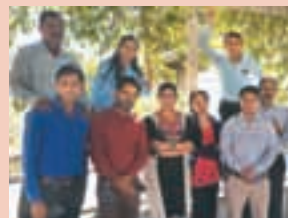
Left to right: Participants at training sessions for the WOW experience, STEPS and Human Resource training programmes